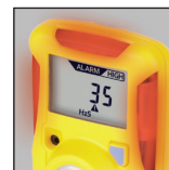
Easy to See