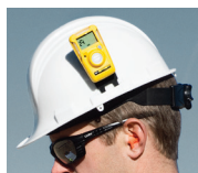
Hard Hat Clip