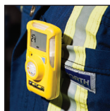
Easy To Wear