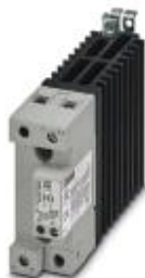
Single-phase solid-state contactor, input voltage: 24 V DC, output current: 50 A, zero voltage switch

Please be informed that the data shown in this PDF Document is generated from our Online Catalog. Please find the complete data in the user's documentation. Our General Terms of Use for Downloads are valid ( http://phoenixcontact.com/download )